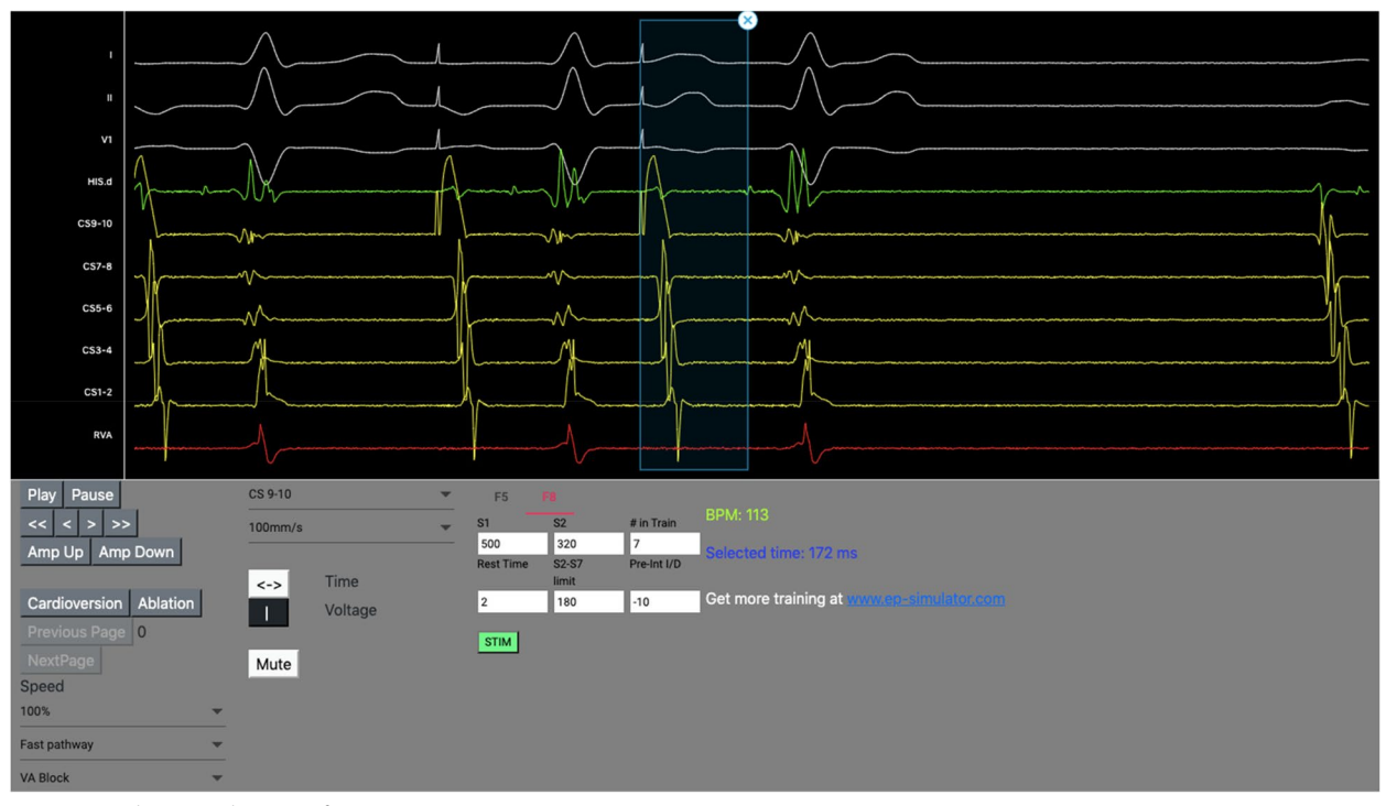
Fig. 1 Example EP simulator interface

excellent or very good. For 75% of operators, realism of signal interactions was excellent or very good. Moreover, 70% of respondents assessed the realism of operators' experience as excellent or very good.