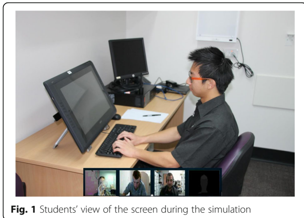
Fig. 1 Students' view of the screen during the simulation

student from another profession conduct a patient consultation and then collaborate with each other in the development and delivery of an interprofessional treatment plan (see Table 2).